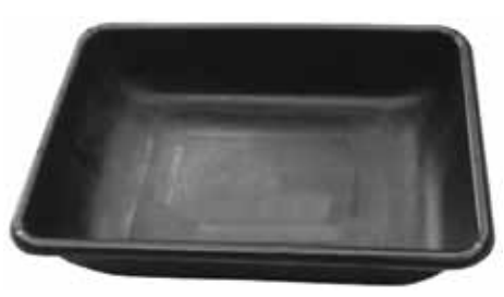
PT20BLACK 20 Gallon

L 35.5" x W 24" x H 7.25" Made of tough, impact resistant, high-density polyethylene which protects against warpage, stress cracks and UV damage. Rounded lip for added durability. Great for washing auto parts and mix-